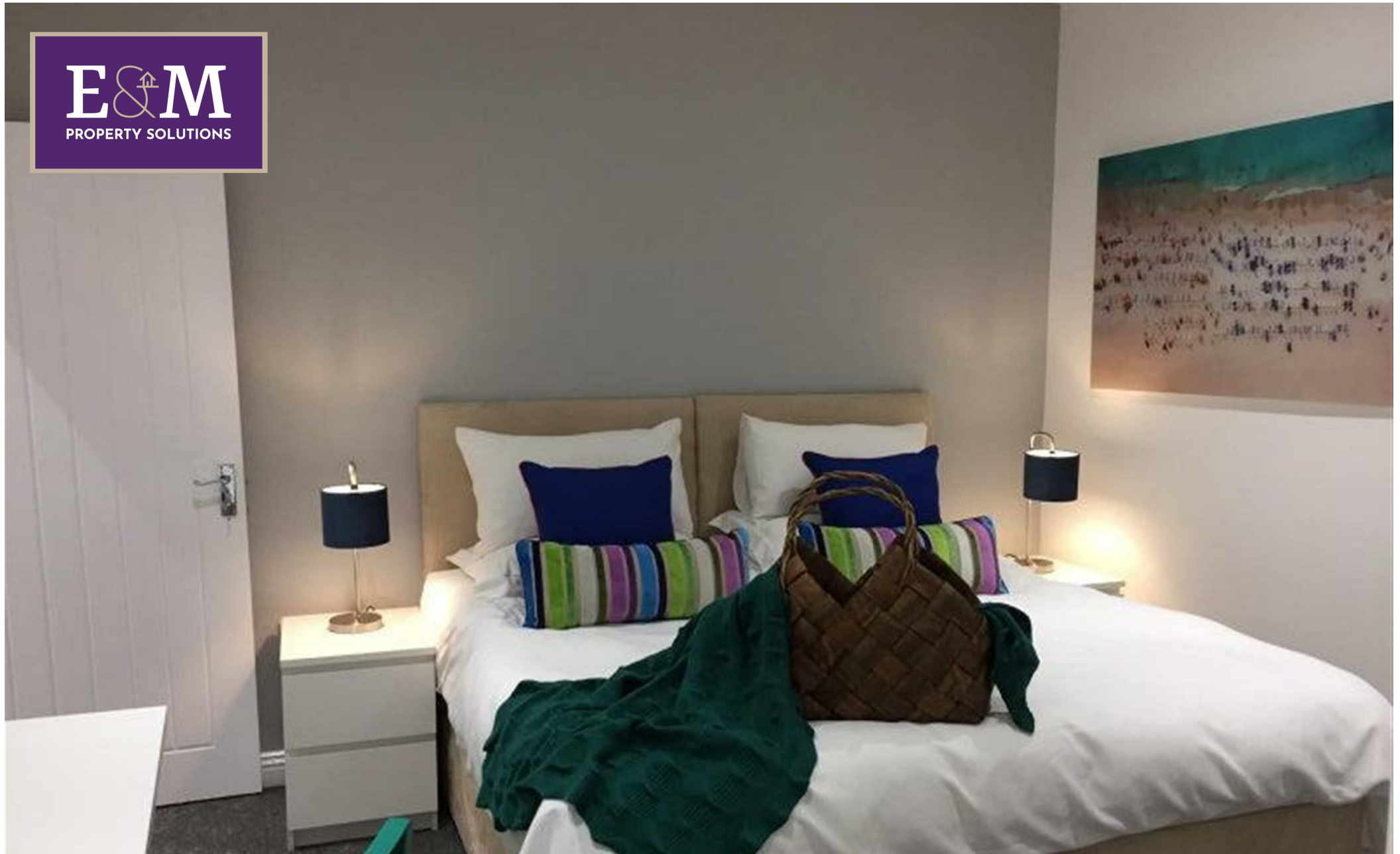
Room 5, 27 Ivan Street, Burnley, Lancashire, BB10 1ES £110 Per week